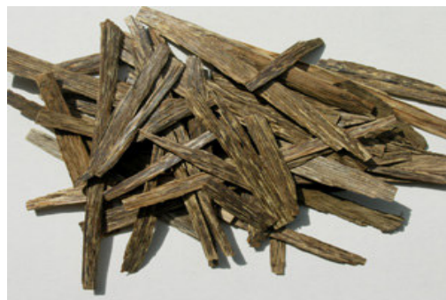
Cultivated Agarwood Chips