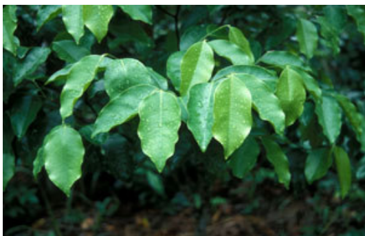
Aquilaria trees grow in the tropical rainforests of Asia and produce Agarwood inside the tree. Old growth trees are rare due to extensive harvesting by collectors of Agarwood during past centuries.

The resinous wood or oil extracted from the inside of some trees is extremely valuable since it is highly regarded for use during Buddhist and Islamic cultural activities as well as an important ingredient in many traditional medicines. It is also an extremely important component in traditional Japanese incense ceremonies.