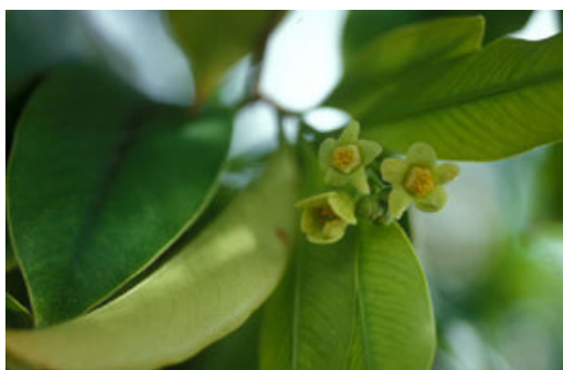
Flowers produced by the of Aquilaria Tree